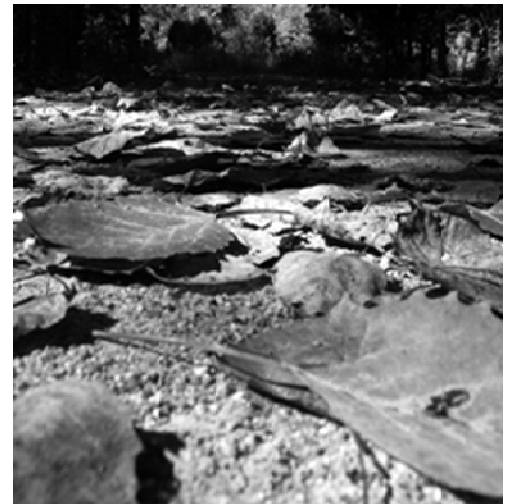
Hutchinson sells bagged compost to garden centers.

"We wanted to see if there was a different way we could do leaf removal in Hutchinson," Olson said.